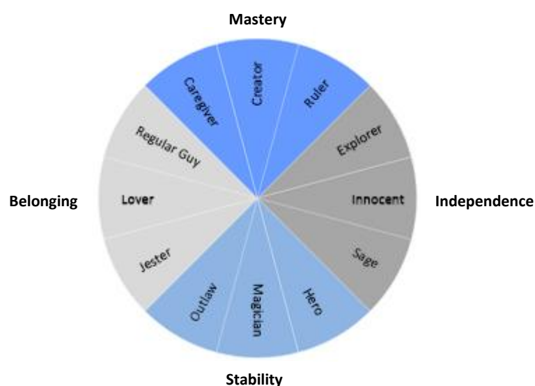
Figure 1. Mark and Pearson’s (2001) classification of archetypes

A review of the literature showed that other authors classified archetypes in a different way. Jansen (2006) used the axes Ego versus Social and Freedom versus Order for example. Bolhuis (2011) identified three different clusters, namely a Freedom, Order and Social cluster. Van Nistelrooij (2013) also distinguished three different clusters: an Expressive, Social and Competence cluster. At last, Faber and Mayer (2009) identified five different clusters of archetypes: the Knower, Carer, Striver, Conflicter and Everyperson. These clusters are not based on axes. Although all authors used the same twelve archetypes, the classification is still ambiguous.